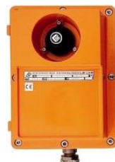
Repeater ATEX KLM214