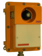
Repeater & Flash ATEX SVG 214 A6CA