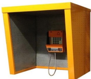
Acoustic Booth De 25 dB