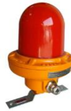
Light Flash ATEX FEF232