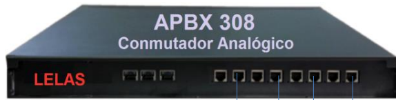
ATEX Telephone Exchange TCT376E1L6

Compatible with Any Telephone Exchange Analog or Digital in Safe Zone If not, use ATEX Telephone Exchange